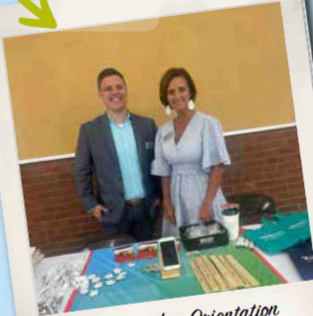
New Teacher Orientation Griffin-Spalding County

We are excited that events are back happening in person and our calendar is filling up fast! Keep a look out for The Southern out and about in your community for the Fall. Here are few places we have been spreading the word about The Southern!