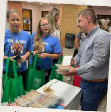
New Teacher Orientation Butts County