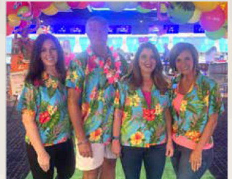
Tiki Bowling with the Coweta Chamber