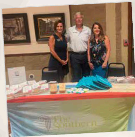
New Teacher Orientation Coweta County